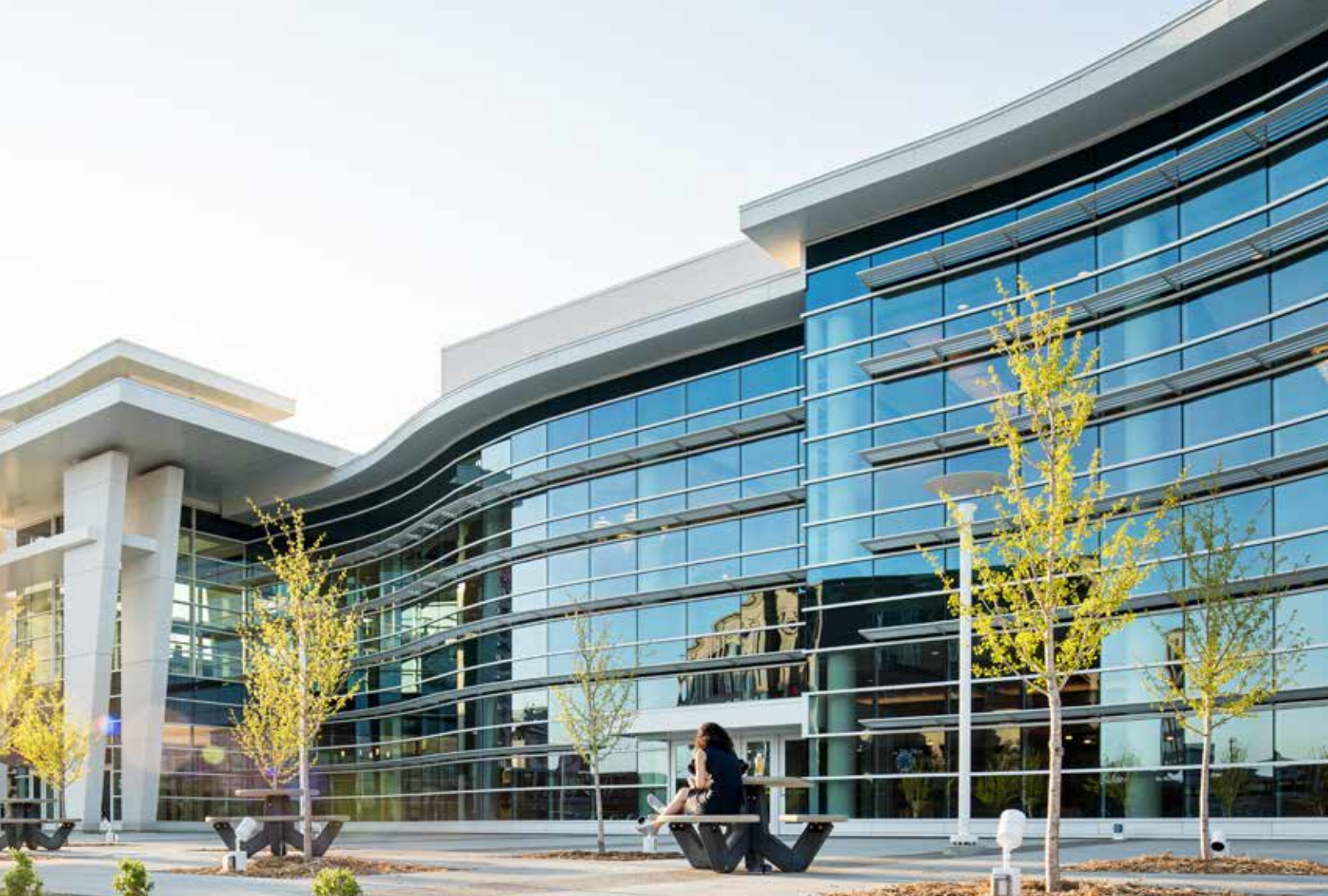
SunGuard SNX 51/23 helped create the impressive Mayo Civic Center - Expansion, Rochester, Minnesota.