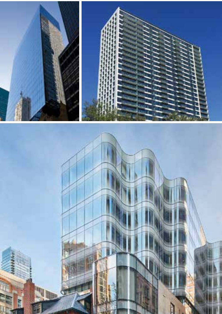
Top left: SunGuard AG 43 permits spectacular views from the Aman Tower in New York City.

SunGuard® Advanced Architectural Glass from Guardian helps architects create striking building designs using natural light and color—while significantly reducing energy costs. SunGuard low-emissivity and solar control coated glass is specifically designed for a wide variety of commercial applications, including office buildings, high-rise apartments, schools, hospitals, libraries, government buildings, arenas and more. We can help architects and designers with glass solutions that meet local performance needs and realize their vision.