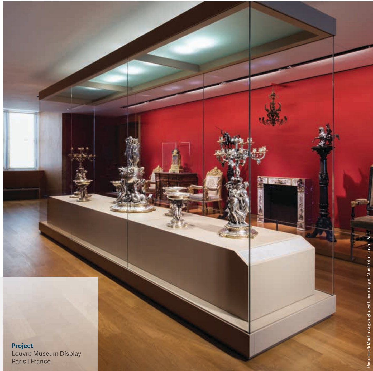
Project Louvre Museum Display Paris | France