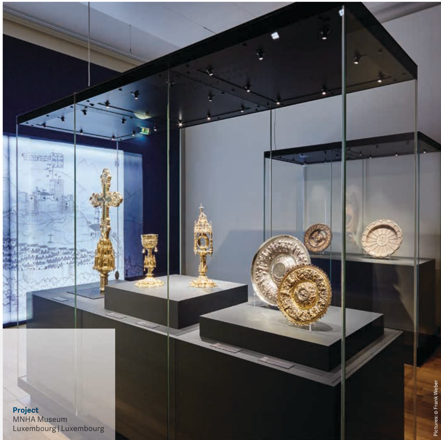
Project MNHA Museum Luxembourg | Luxembourg