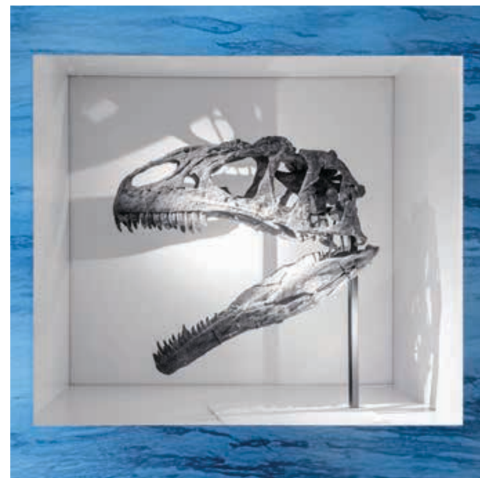
Project Marqueyssac Gardens Allosaurus Vezac | France